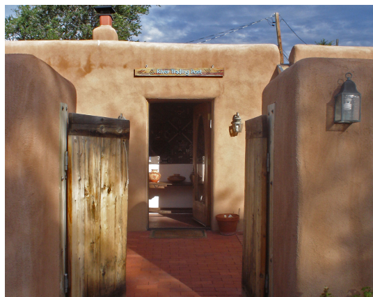
River Trading Post - Santa Fe. Our historic adobe house on historic Canyon Road., hosts the 6th annual Arts of Native America Show and Sale. Thursday, August 18 through Sunday, August 21.

The annual event kicks off on Thursday, August 18 in a special artist's preview from 4pm through 7pm, where visitors will also be treated to Native Drums, Fry Bread and Navajo Tacos.