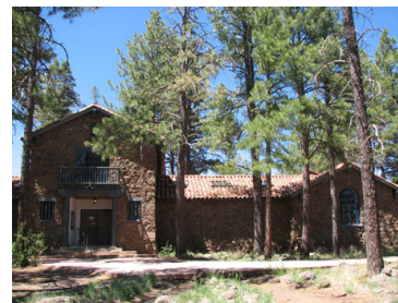
Nestled among the tall pines is the Museum of Northern Arizona. A place where visitors can enjoy learning about the Colorado Plateau cultures, and enjoy hiking through the beautiful campus.